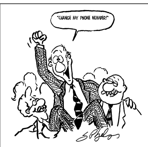
"Pastor, you've just retired from ministry. What are you going to do now?"

"This is the day that the Lord has made; let us rejoice and be glad in it." – Psalm 118:24